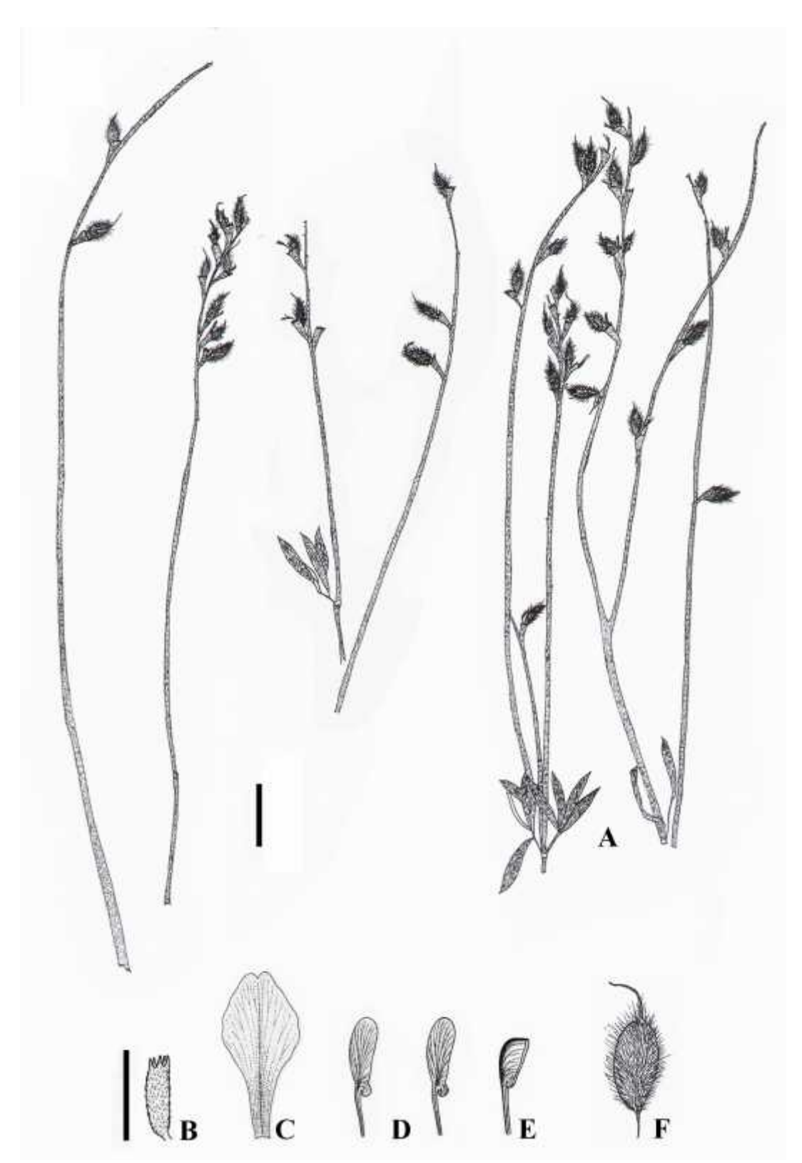
Fig.\ 1.\ \textit{Astragalus borujenensis}.\ -\ A:\ Habit\ (with\ fruit).\ -\ B:\ Calyx.\ -\ C:\ Standard.\ -\ D:\ Wings.\ -\ E:\ Keel.\ -\ F:\ Pod. Scale bar A = 2 cm, B-C and F = 0.6 cm, D-E = 1 cm.