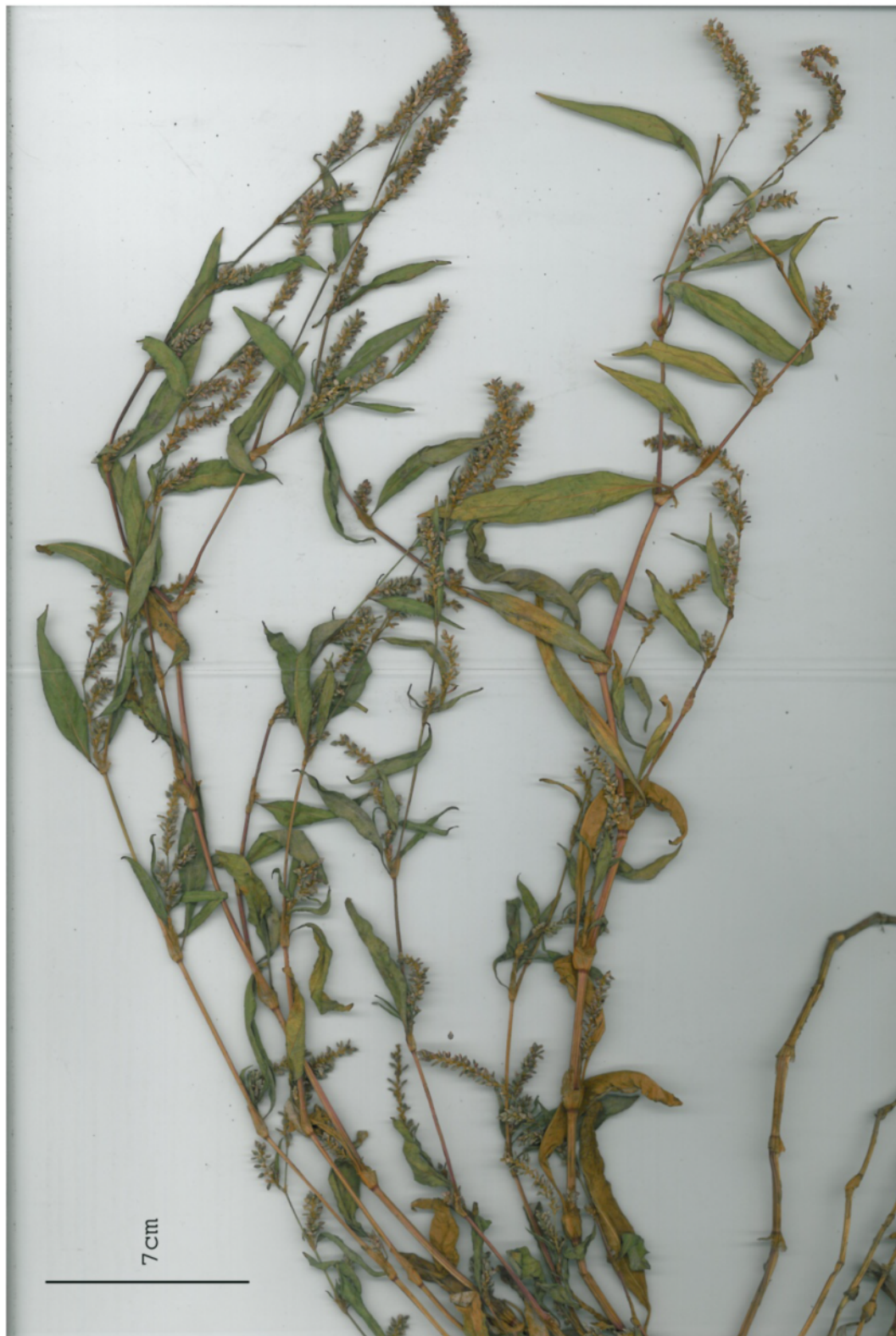
Fig. 1. Persicaria lapathifolia subsp. nodosa .