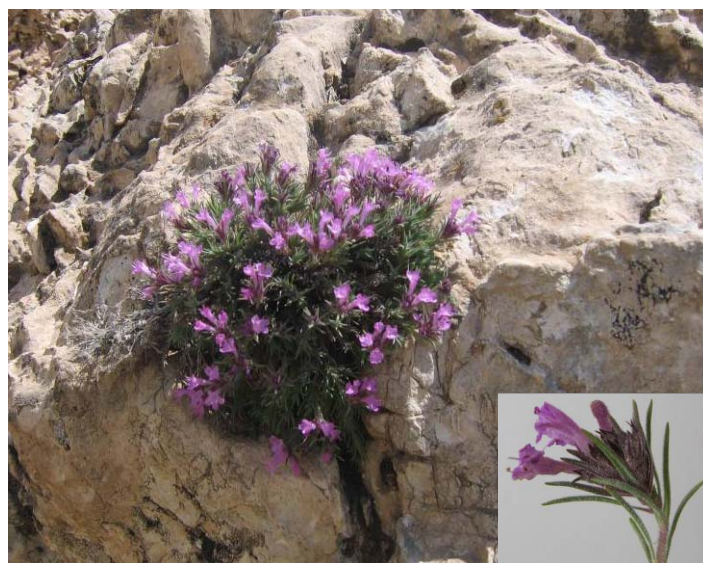
Fig.1. Thymus persicus in its natural habitat (Takab: Baderlu). Scale bar=1 cm.

average standard deviation of split frequencies was approaching a value of 0.01 as suggested by Ronquist & al. (2005). After discarding the first 25% of trees as burn-in, a 50%-majority-rule consensus tree of the remaining trees was computed accompanied with posterior probability ( PP ) values for individual clades. Tree visualization was carried out using Tree View version 1.6.6 (Page, 2001).