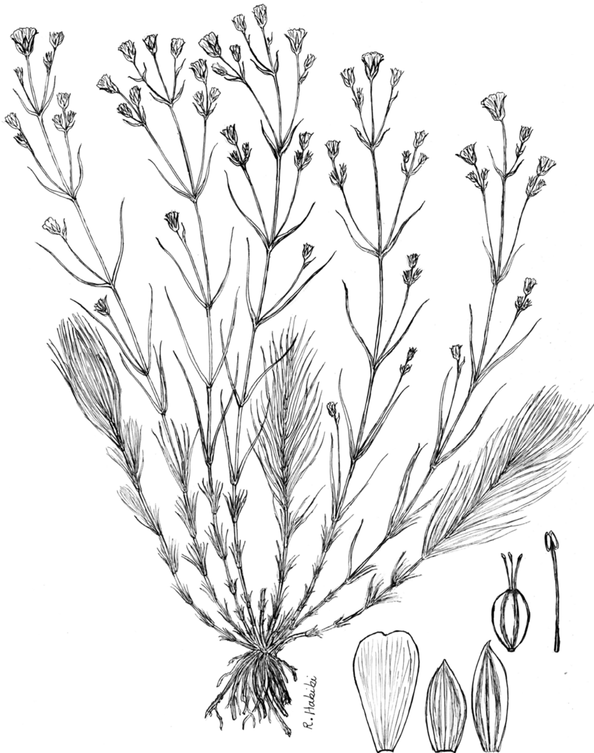
Fig. 3. Arenaria longibracteata ( \times 0.66 ); sepals and petal ( \times 3.3 .); stamen and ovary ( \times 6.6 ).