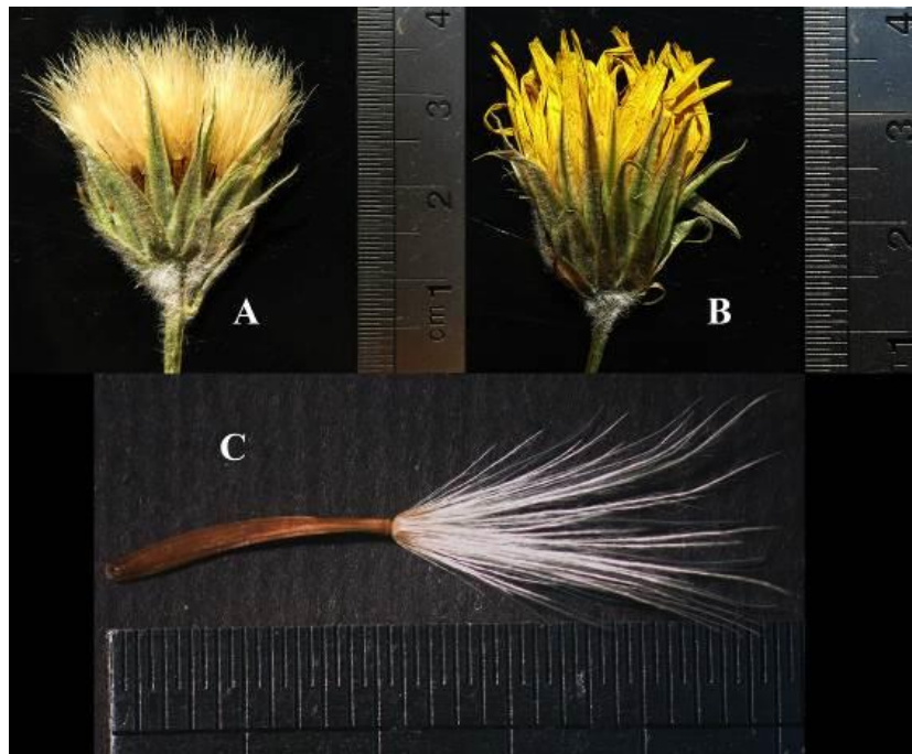
Fig. 3. Scorzonera alborzensis Safavi & Amini Rad: (A & B) capitule; (C) achene (107037-TARI).

Distribution, habitat and phenology: Scorzonera alborzensis is known from the type locality in Central Alborz Mountains in N. Iran. It was found in high altitude slopes of Siah Sang Mountain with the rocky bed at 3023 m a.s.l. The new species is a narrow endemic (fig. 4). Flowers appear in June and mature achenes in July.