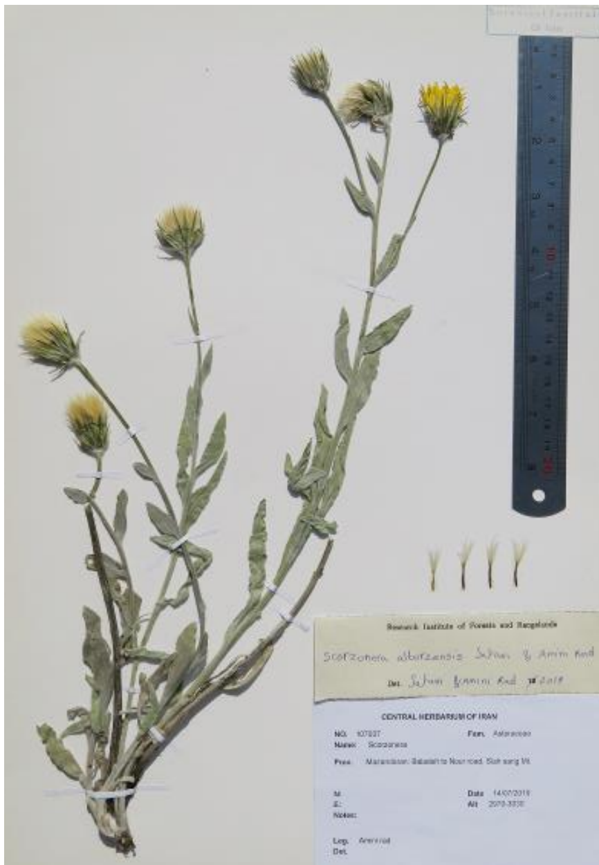
Fig. 1. Scorzonera alborzensis Safavi & Amini Rad (TARI).

Type: Iran, Mazandaran, Baladeh to Nour road, Siah Sang Mt., 3023 m, 14 July 2019, Amini Rad 107037 (holotype TARI).