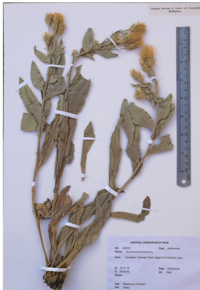
Fig. 1. Image of herbarium specimen of Scorzonera tomentosa L. (TARI).