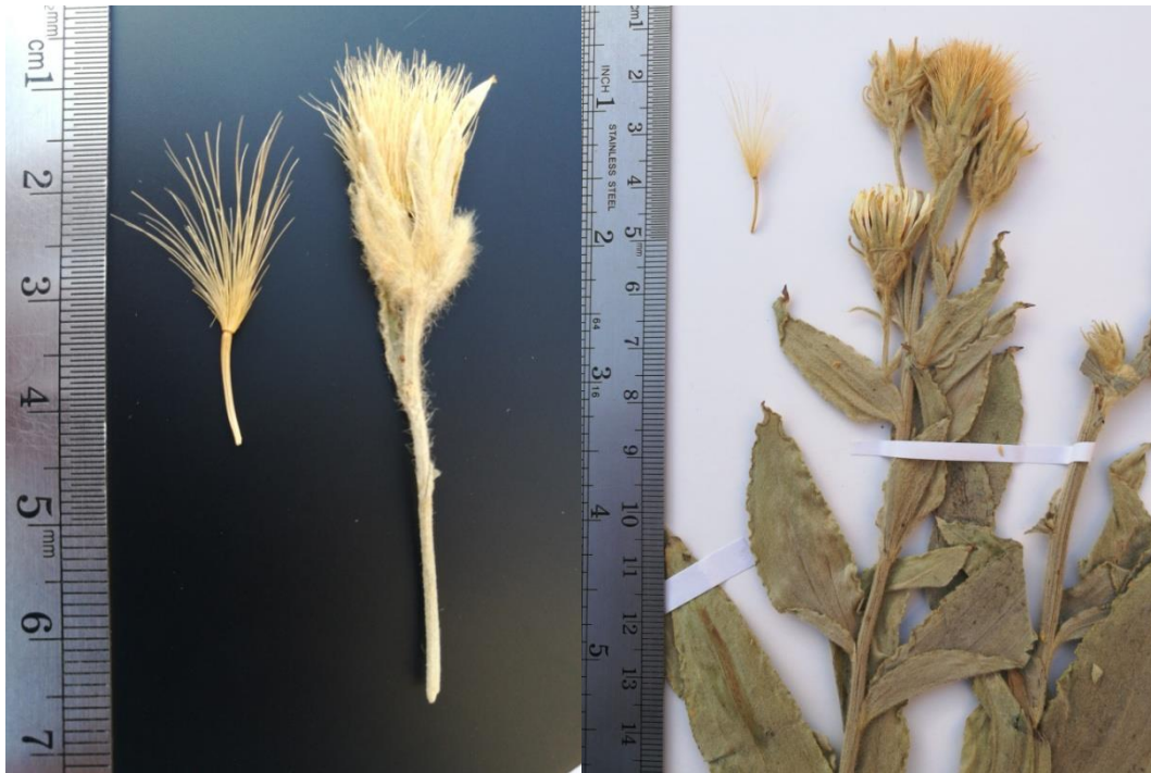
Fig. 2. Achene and capitule of Scorzonera tomentosa L. (106218-TARI).