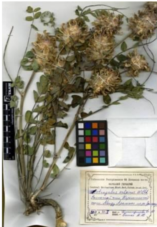
Fig. 2. Astragalus vulpinus Willd.

Centaurea apiculata Ledeb. Consp. Fl. Asia Med. 10: 411 (1993).