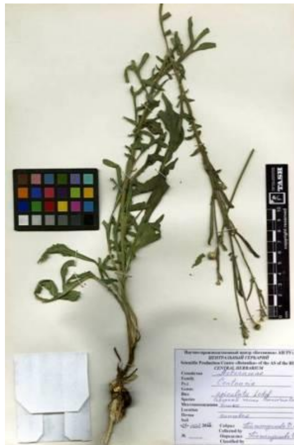
Fig. 3. Centaurea apiculata Ledeb.

Based on these collections from Ustyurt, Astragalus vulpinus Willd. and Centaurea apiculata Ledeb. are included in the list of flora Uzbekistan.