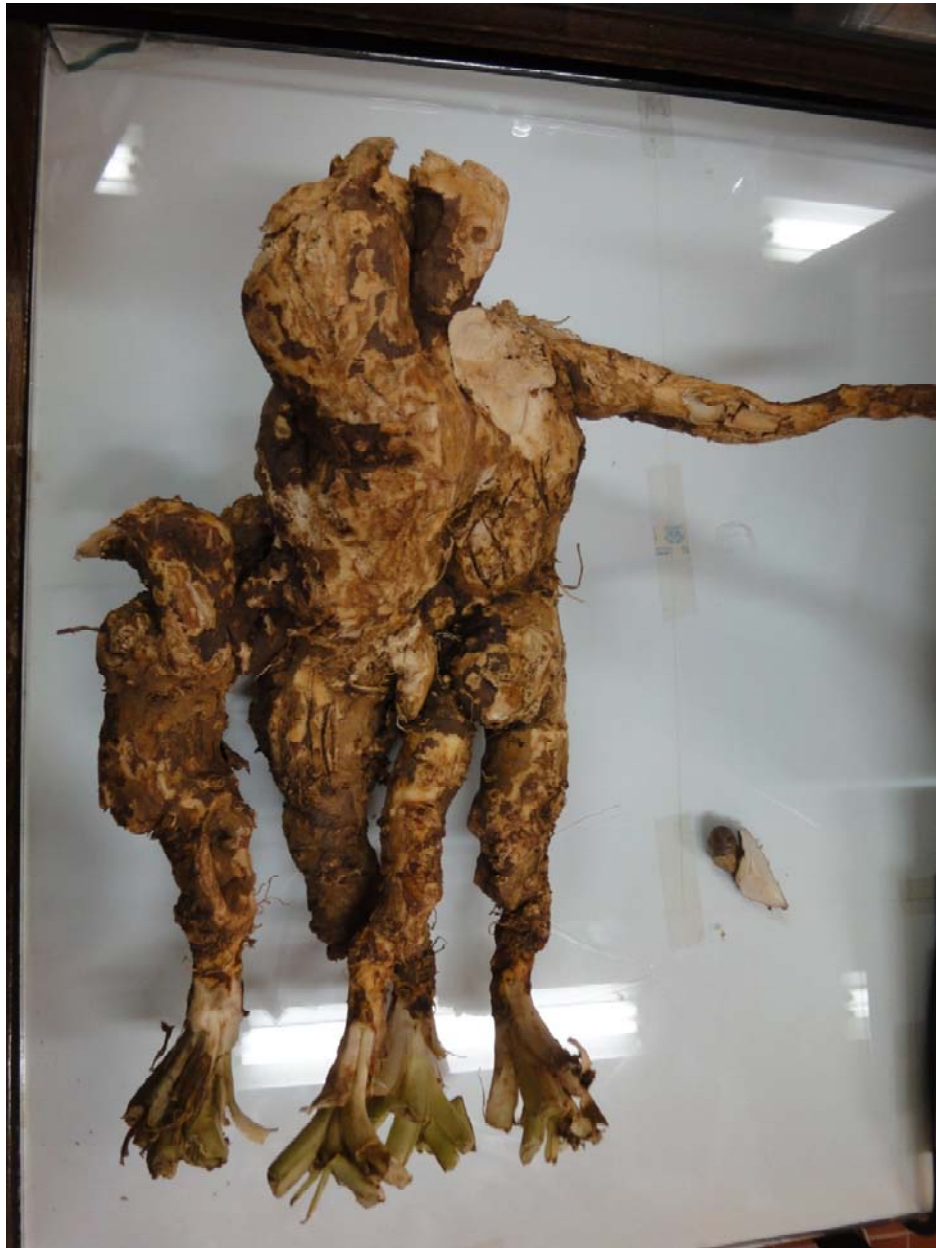
Fig. 3. Root of Mandragora autumnalis .