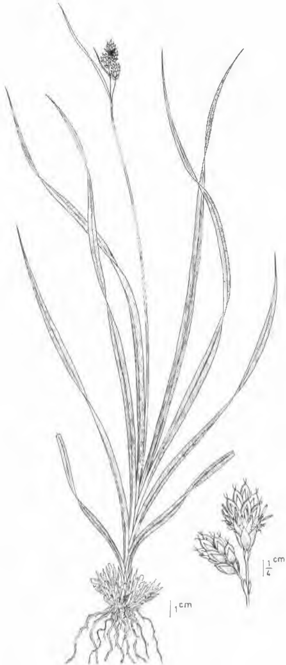
Fig. 1. Carex kukkonenii .