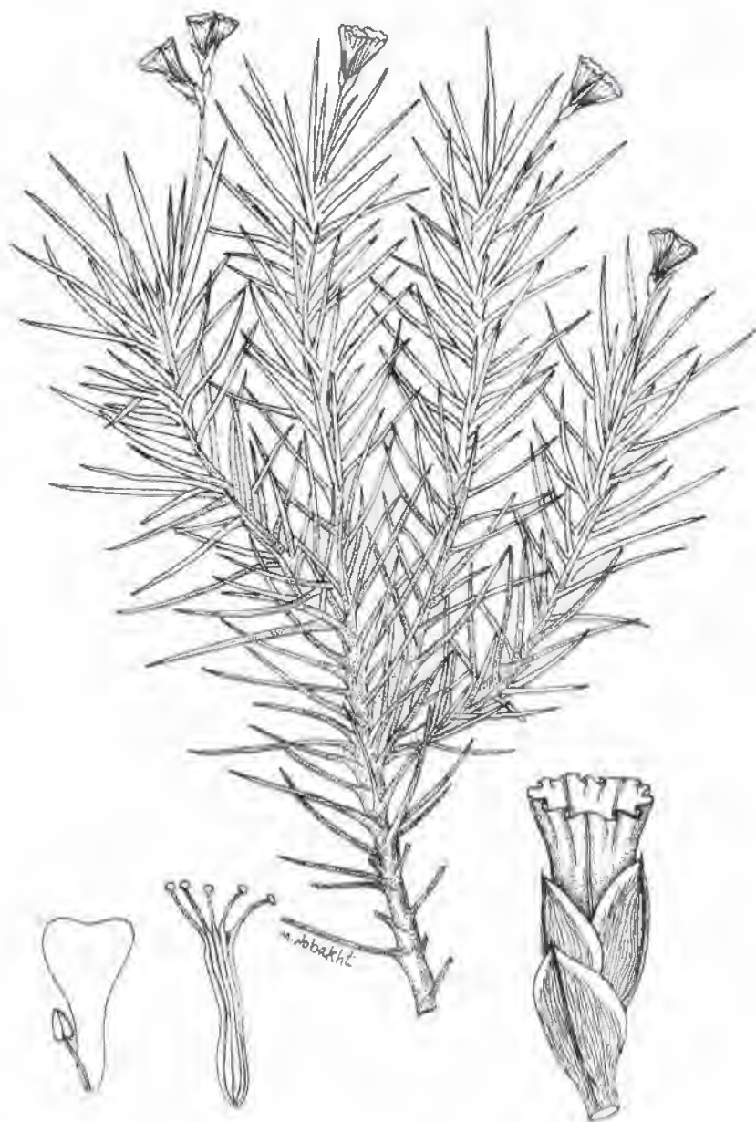
Fig. 2. Acantholimon mirtadzadini (x 1.5); spikelet (x 5); gynoecium (x 5); petal (x 4).