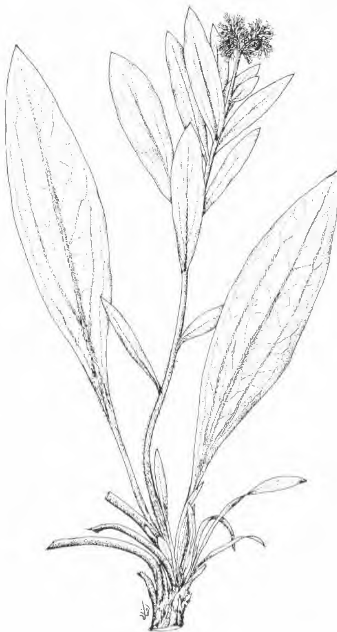
Fig. 1. Solenanthus turkestanicus (x0.7).