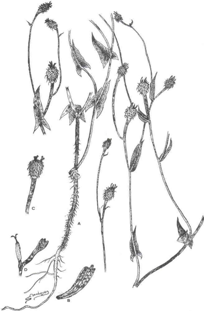
Fig. 1. Acanthocephalus benthamianus . — A. Habit. — B. Achene. — C. Capitule. — D. Floret.