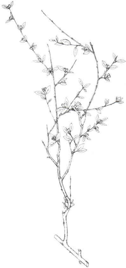
Fig.2. Cotoneaster rechingeri (x 0.4).

This species was indicated only from Turcomania and Afghanistan in Flora Iranica (Riedl 1969 p. 18).