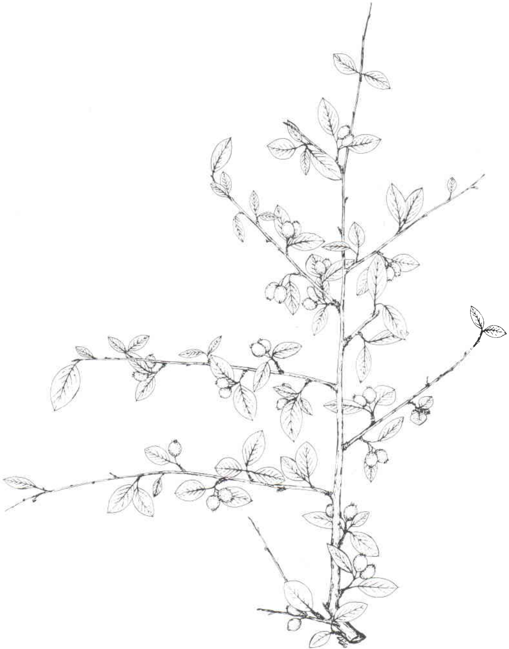
Fig.3. Cotoneaster turcomanicus (x 0.6).