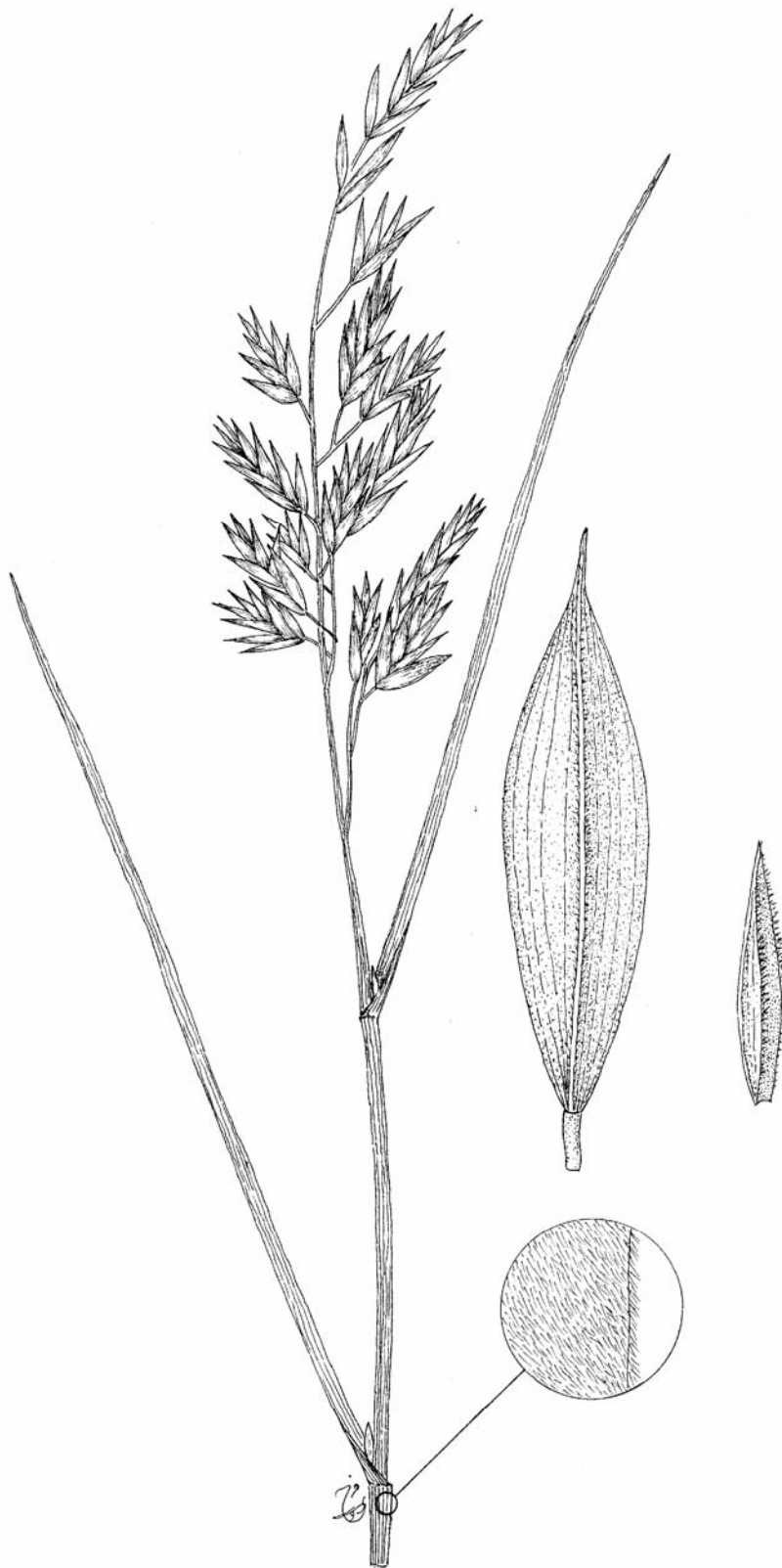
Fig. 1. Bromus catharticus (x 0.7); lemma and Palea (x 2.4)