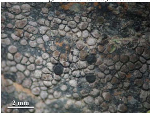
Fig. 3. Rhizocarpon geminatum .