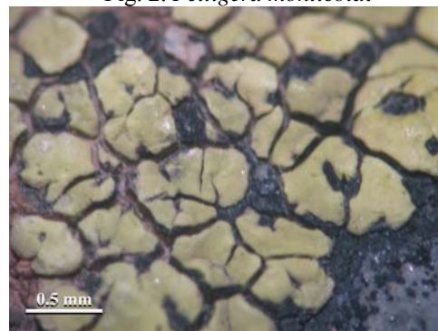
Fig. 4. Rhizocarpon geographicum subsp. tinei .