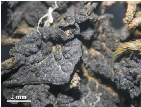
Fig. 1. Collema subflaccidum .