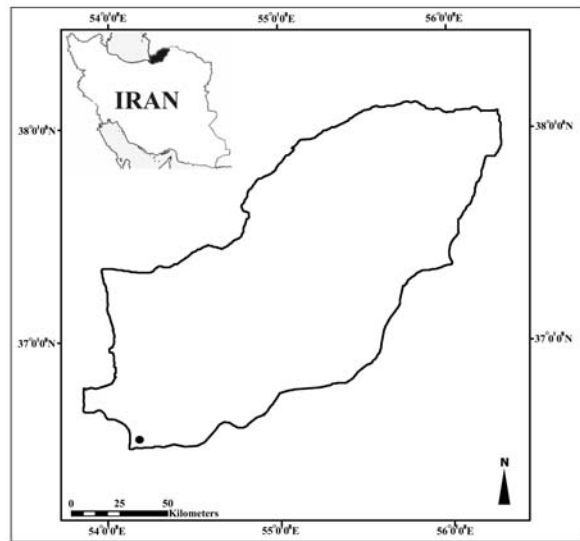
Map 1. Geographical situation of Deraznow area (URL: http://www.mpo-kh.ir ).

Geomorphologically, the fertile soils of the area are composed of sand (44%), silt (42%) and clay (14%) with some minerals containing K (758 p.p.m), P (40.6