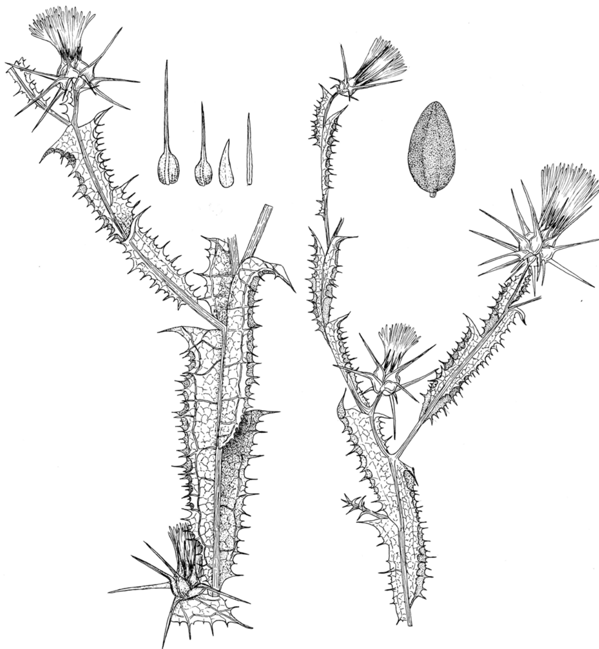
Fig. 2. Continued.

exappendiculate, appressed in basal part, free in upper part, hardened at the base, smooth at the margin; basal part of outer bracts 3.5 mm broad, attenuate toward the apex into three-angled 7 mm long spine, spreading, sometimes reflexed; intermediate bracts 5 mm broad at base, terminating to a 2-3 cm long spreading spine; inner bracts erect, lanceolate, acuminate; innermost bracts erect, straight, included. Receptacle bristles