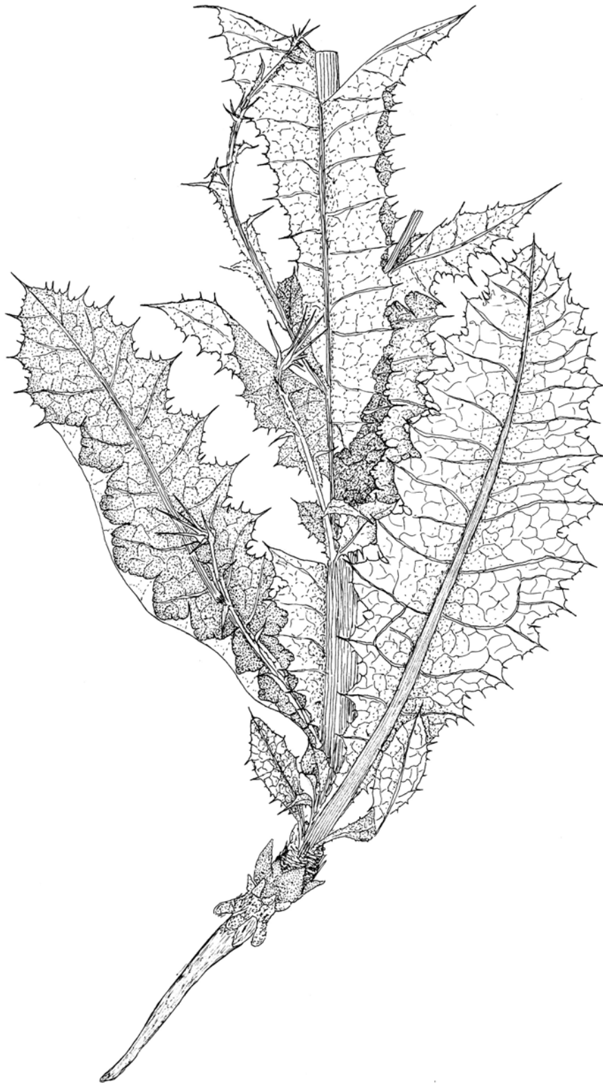
Fig. 2. Cousinia longibracteata , habit ( \times 0.65 ), bracts and achene. Drawn from the holotype.