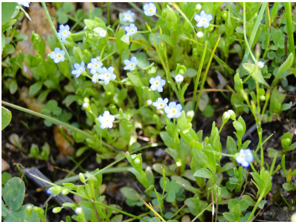
Fig. 2. Myosotis diminuta . Habitate and individuals. – Photographs taken at Damirli Mt., 4 June 2013, by M. Mahmoodi.