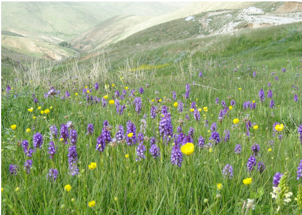
Fig. 3. A general view of the habitat of Myosotis diminuta . Dominant companion species: Dactylorhiza umbrosa (Kar. & Kir.) Nevski, Ranunculus kotschyi Boiss. and Pedicularis sibthorpii Boiss. – Photograph taken at Damirli Mt., 4 June 2013, by M. Mahmoodi.