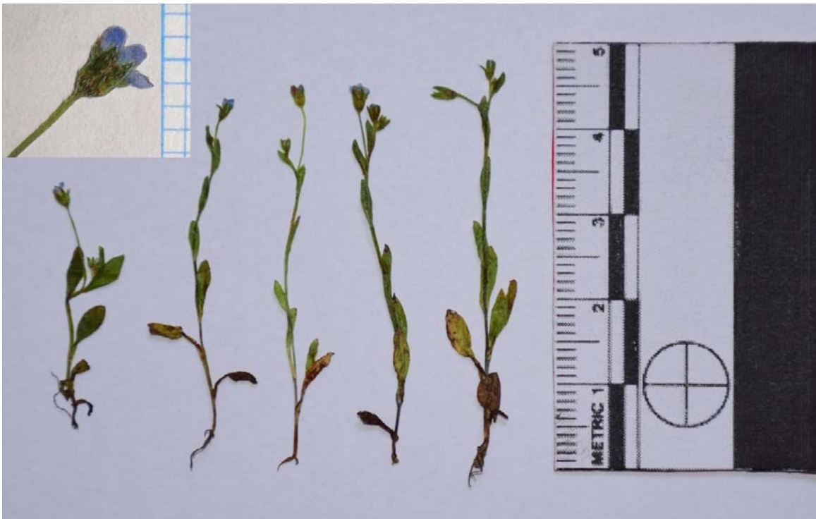
Fig. 1. Myosotis diminuta . Herbarium specimen showing habit of individuals and a flower, Mohammadi 99889 (TARI, T).