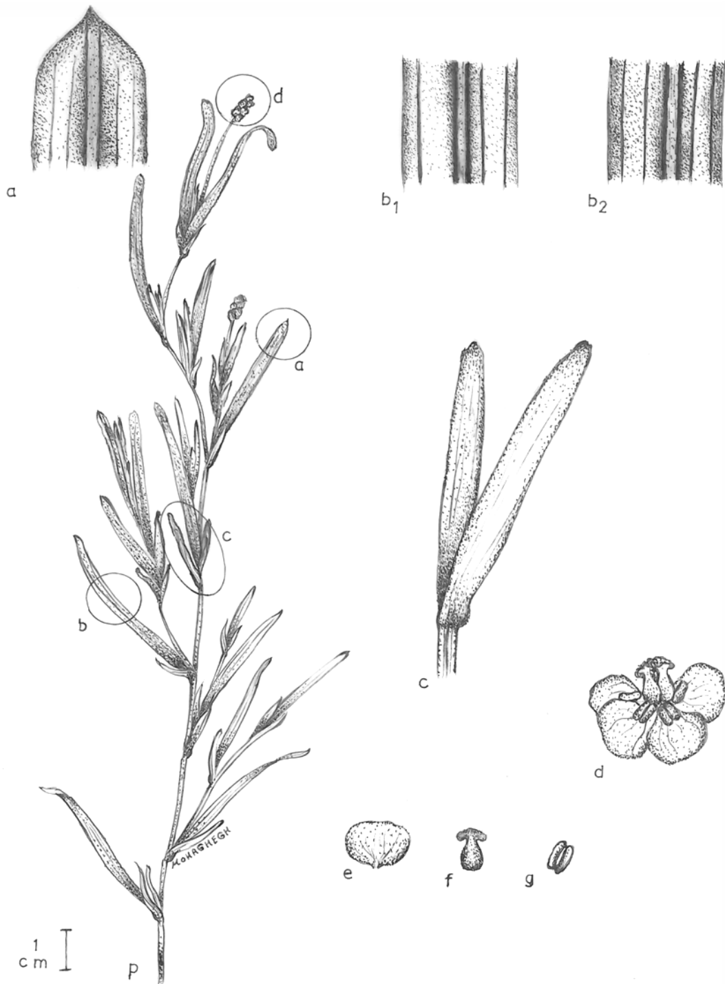
Fig. 1. Potamogeton friesii ( \times 1 ), a & b, leaf ( \times 8 ); c, stipules ( \times 8 ); d, flower ( \times 8 ); e, tepal ( \times 8 ); f, carpel ( \times 8 ); g, stamen ( \times 8 ).