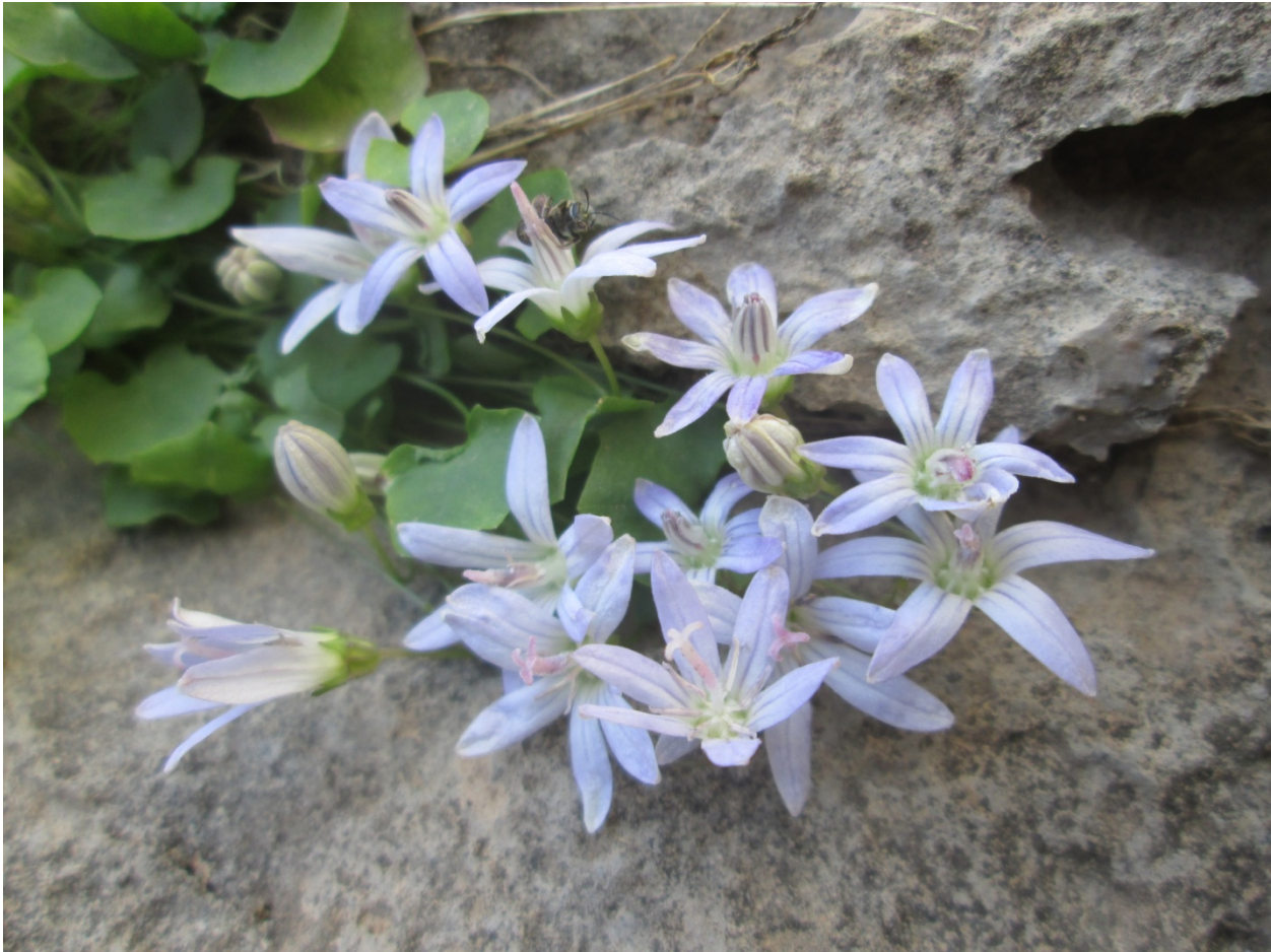
Fig. 2. Campanula kurdistanica (photo taken by H. Maroofi in natural habitat of the species).