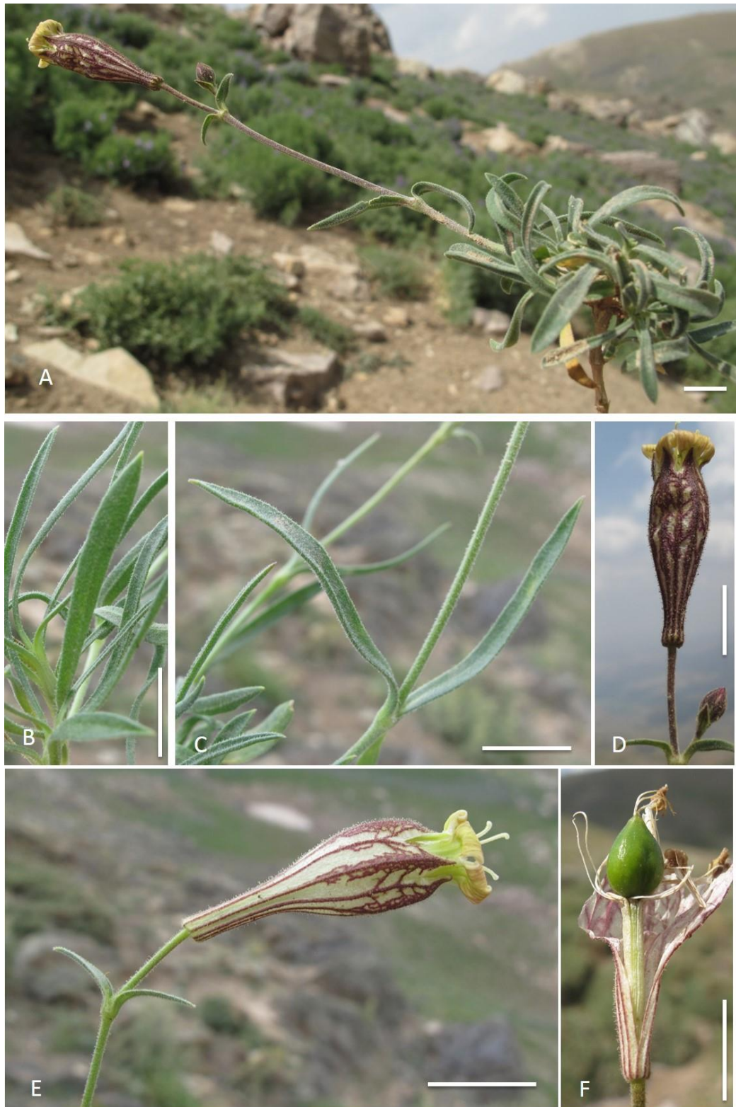
Fig. 3. Silene retinervis : A, Plant habit (SPNH-5707); B, basal leaf; C, cauline leaf; D, inflorescence; E, flower; f. unripe capsule and Antophore (scale bar 10 mm).