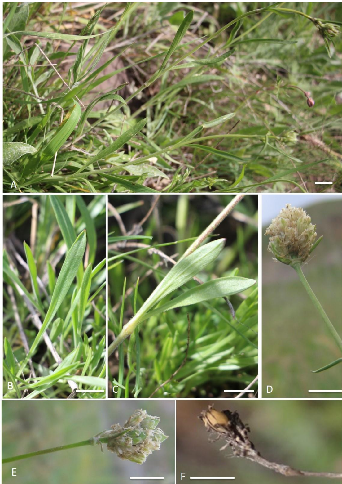
Fig. 1. Silene capitellata : A, Plant habit in natural habitat (SPNH-5617); B, basal leaf; C, cauline leaf; D, Inflorescence; E, inflorescence in fruiting time; F, capsule (scale bar 10 mm).