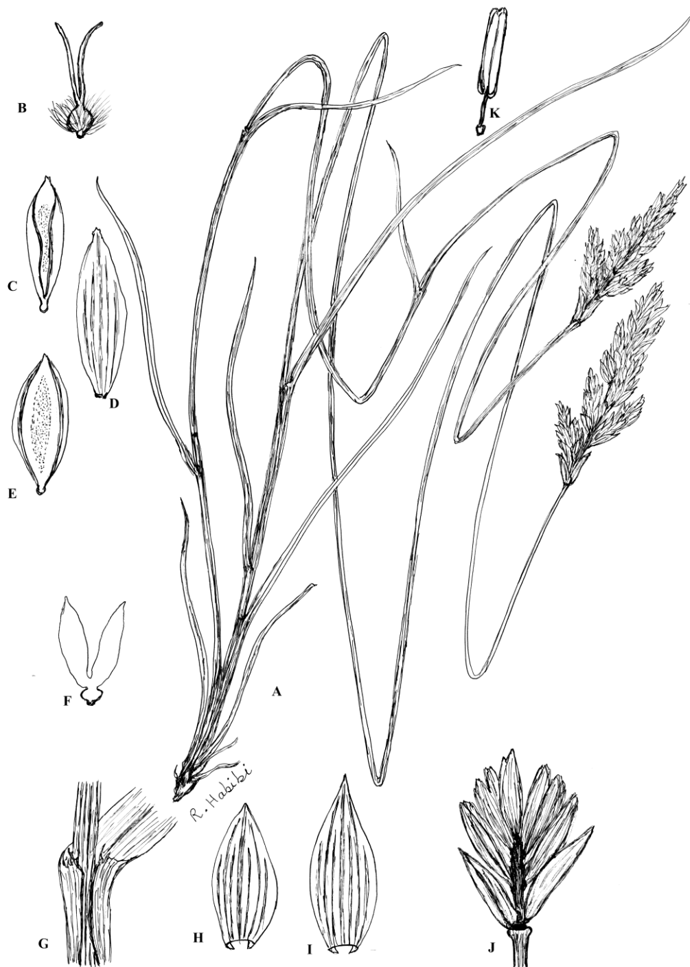
Fig. 1. Elymus shirazicus . A: habit ( \times 0.56 ); B: ovary ( \times 3 ); C & E: palea ( \times 3.4 ); D: lemma ( \times 3.4 ); F: lodicules ( \times 4.5 ); G: ligule ( \times 4.5 ); H: lower glume ( \times 3.9 ); I: upper glume ( \times 3.9 ); J: spikelet ( \times 2.8 ); K: stamen ( \times 3 ).