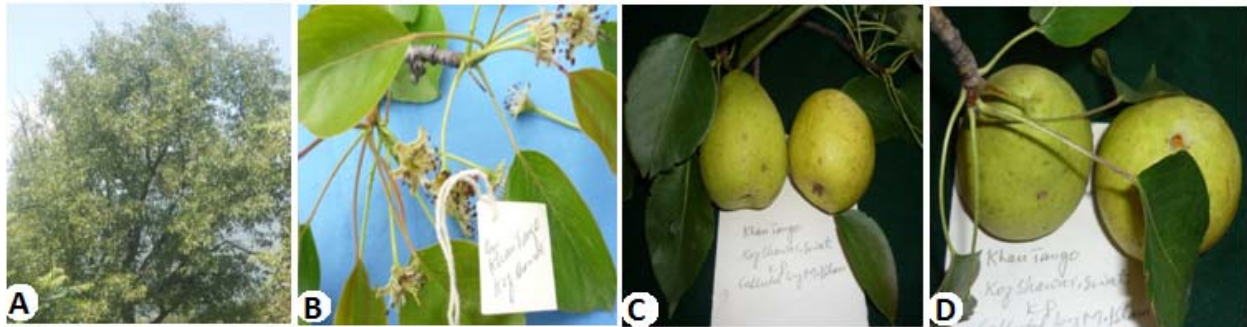
Fig. 4. Pyrus pyrifolia (Burm. f.) Nakai. A, Habit; B, inflorescence; C, terminal view of fruits; D, basal view of fruits.