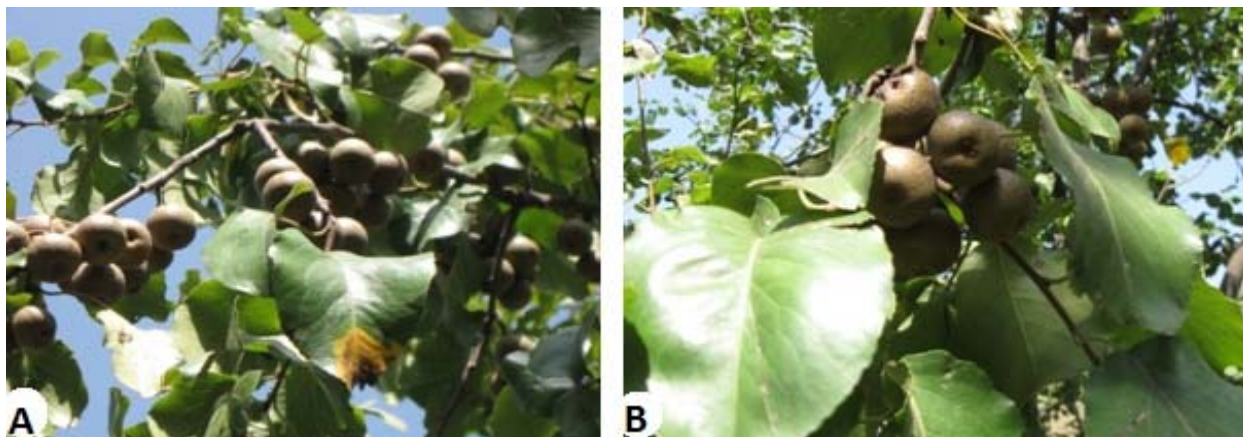
Fig. 2. Pyrus calleryana Decne. A, Branch with fruit and leaves; B, branch with fruits showing terminal part of fruits.

Pyrus bretschneideri Rehder, Proc. Amer. Acad. Arts and Sci. 50: 231(1915) (fig. 3).