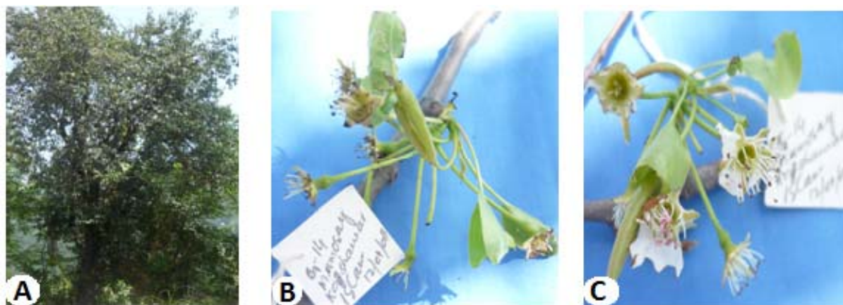
Fig. 3. Pyrus bretschneideri Rehder. A, Habit; B, inflorescence; C, inflorescence with front view of flowers.