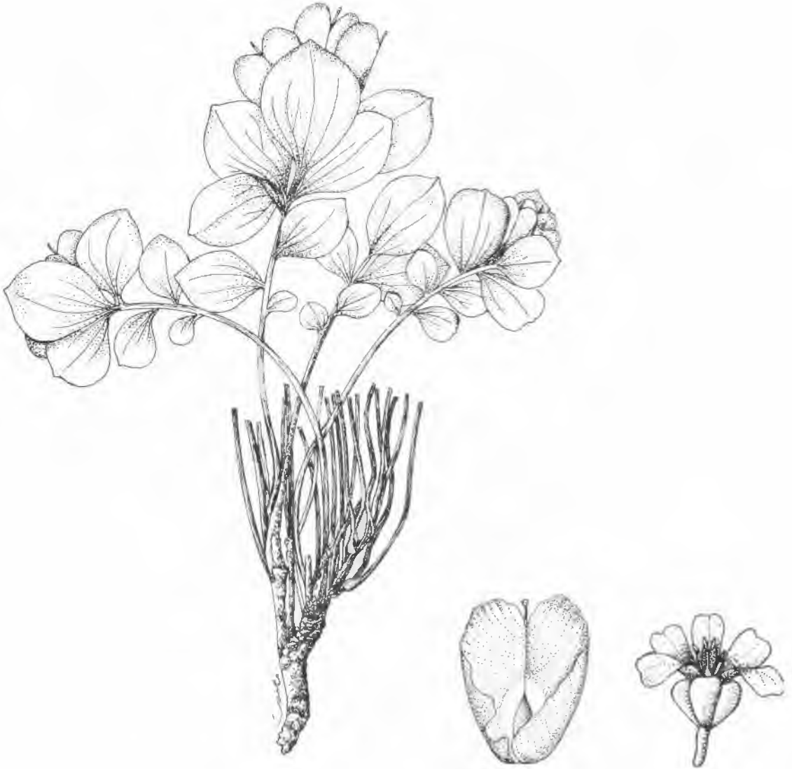
Fig. 1. Aethionema semnanensis nat. size; flower & fruit (x2)

pedicels spreading, erect or \pm recurved, thin, glabrous, ca. 2-5 mm long. Silicle orbicular-elliptic, 15 mm long and ca. 20 mm wide, with very wide wing,