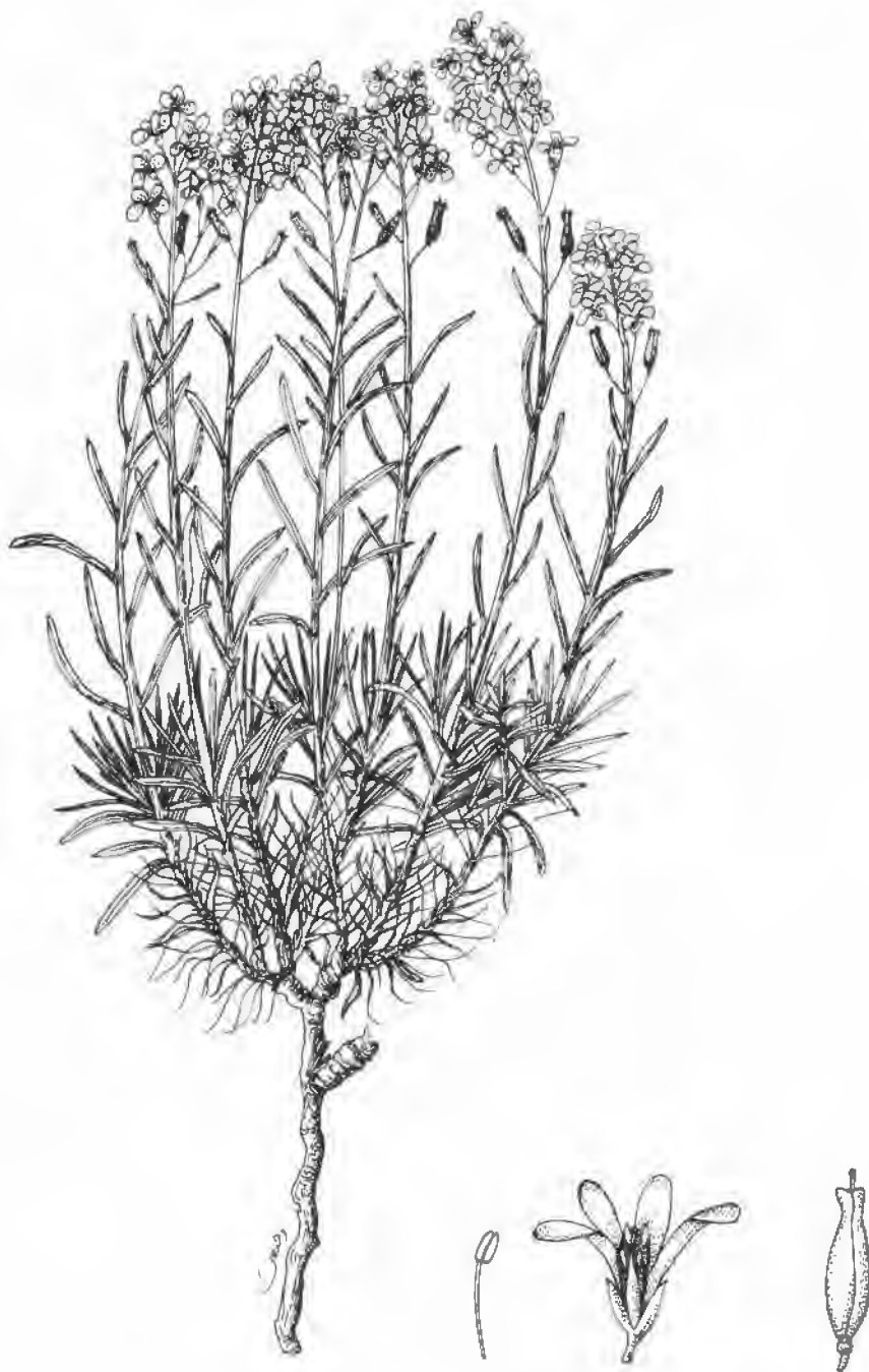
Fig. 6. Thlaspi pulvinata (x2); flower and fruit (x3).