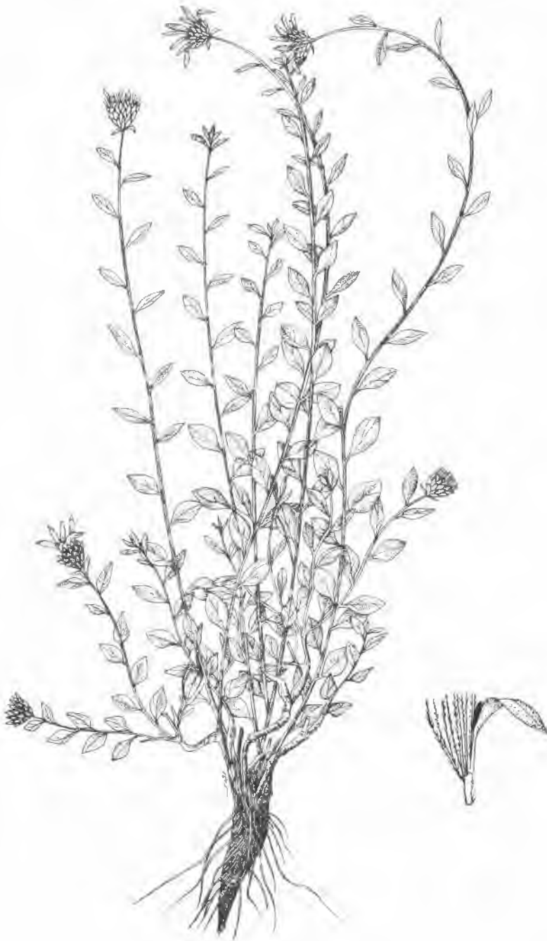
Fig. 2. Aster bachtiaricus (x 0.66); ligulate flower (x3).