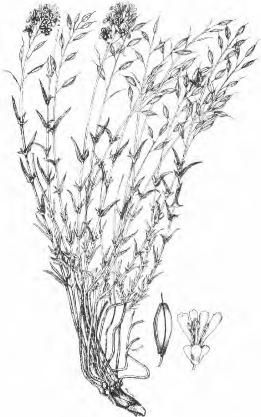
Fig. 5. Thlaspi maassumii (nat. size); flower (x3); fruit (nat. size)