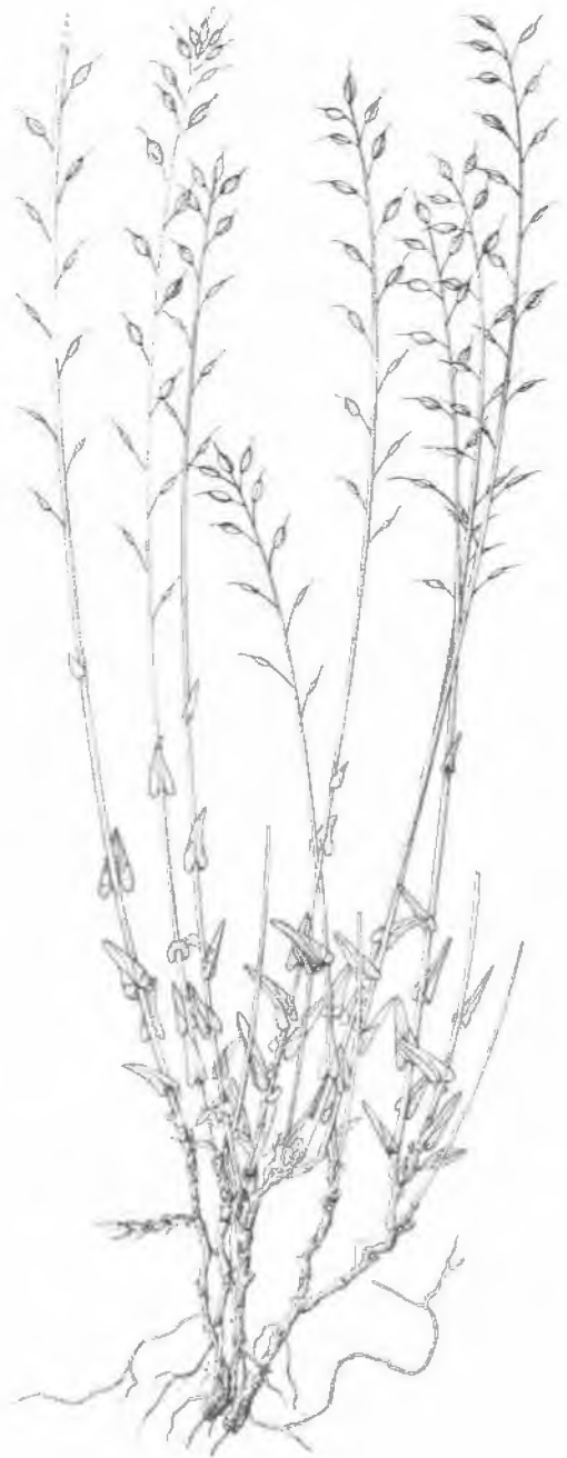
Fig. 7. Thlaspi apterocarpum (x 0.66)

Centaurea pallescens Del. subsp. pallescens is new to the flora of Iran. The general distribution of the centaurea pallescens Del. subsp. Pallescens according to Zohary Fl. palaestina vol. 3 p. 401 (1987) is W. N. and C. Negev, Dead sea area, Arava valley, Moav, Sinai and Egypt.