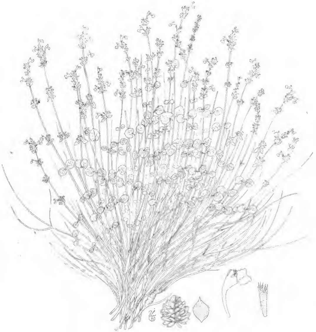
Fig. 1. Nepeta bokhonica (x0.7); leaf (x1.5); bract, corolla and calyx (x3.5).