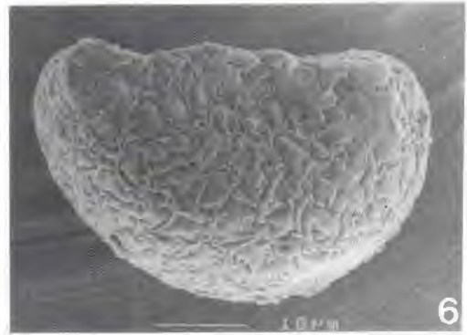
Plate I. Spores in Cystopteris regia . -Nos. 1, 3, 5. fully mature with echinate perispore; no. 2. immature; no. 4. after acetolysis with smooth surface; no. 6. rugate surface.