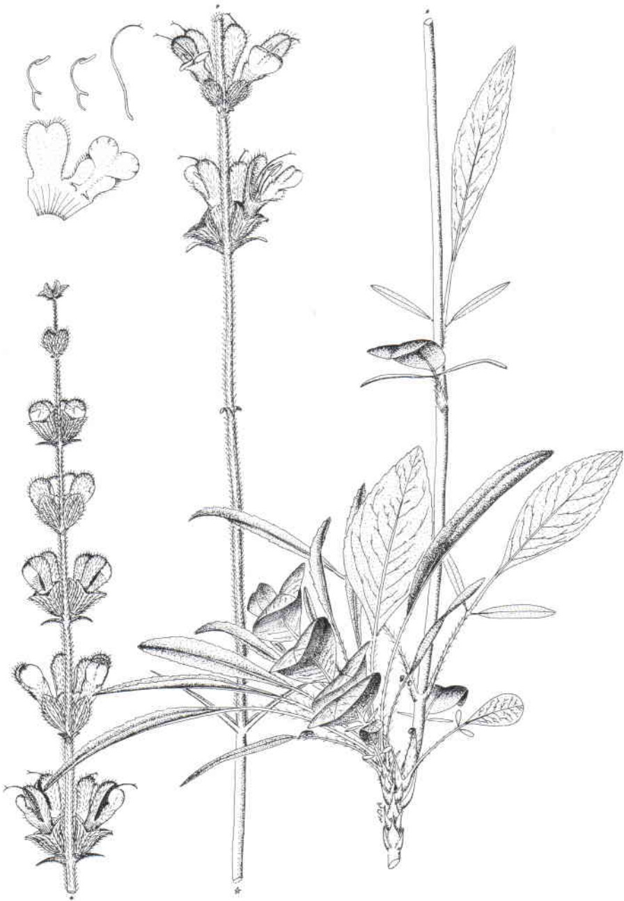
Fig.5. Salvia jamzadii (x 0.56).