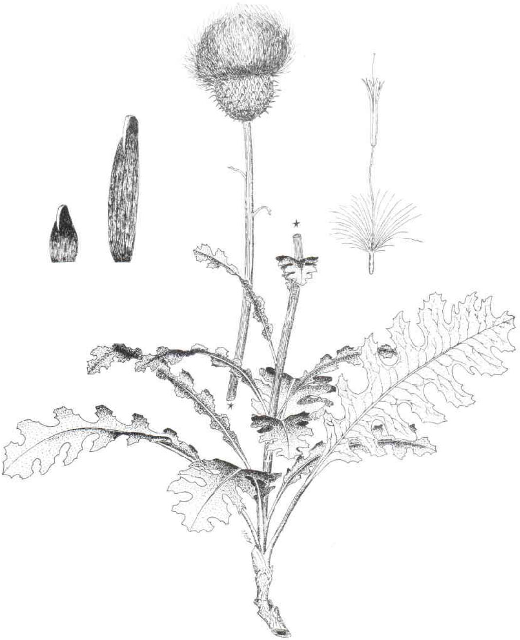
Fig.2. Centaurea paradoxa (x 0.31; flower & phyllary x 1).