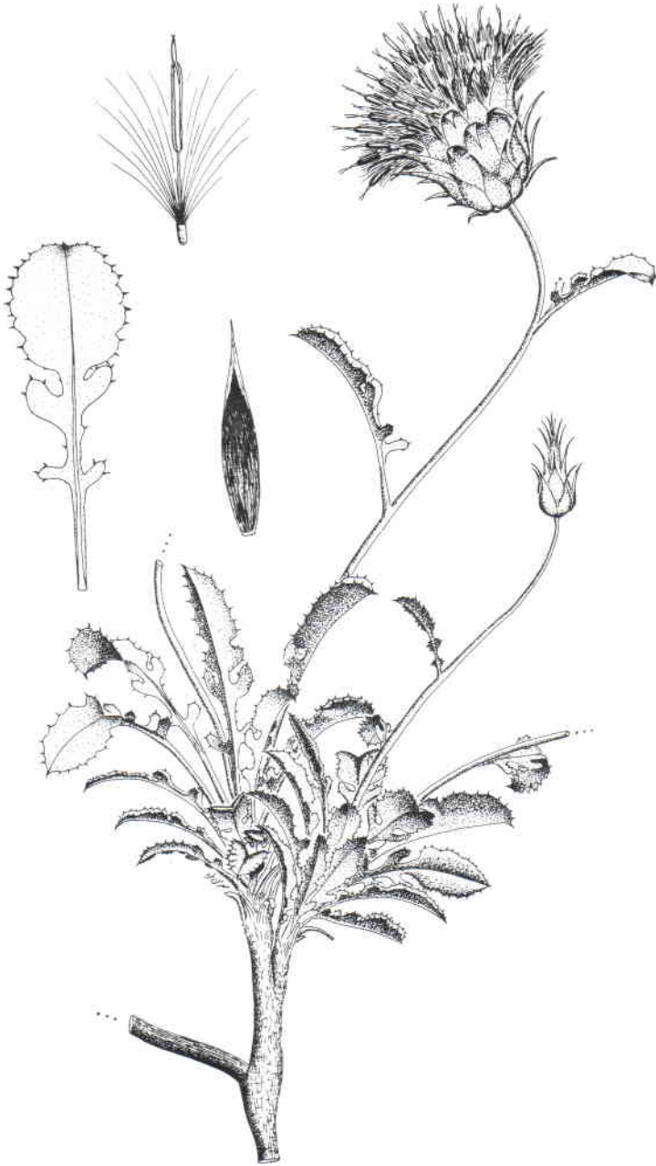
Fig.4. Myopordon damavandica (x 1.2).