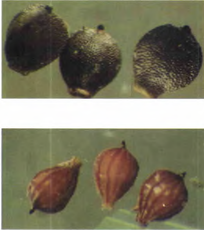
Fig. 2. Nuts of Isolepis species; I. cernua (upper) and I. setacea (lower).