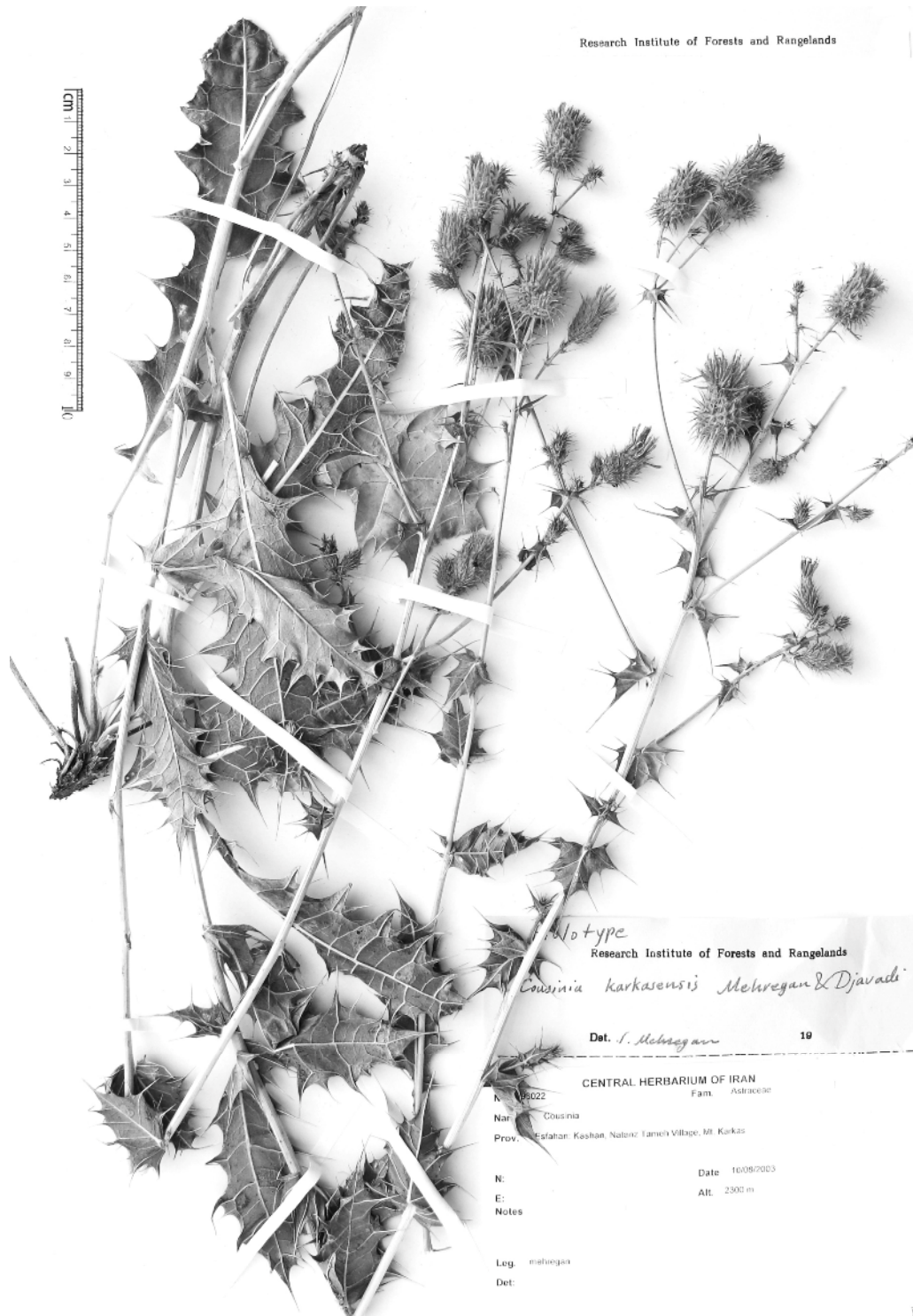
Fig. 1. Holotype of Cousinia karkasensis.