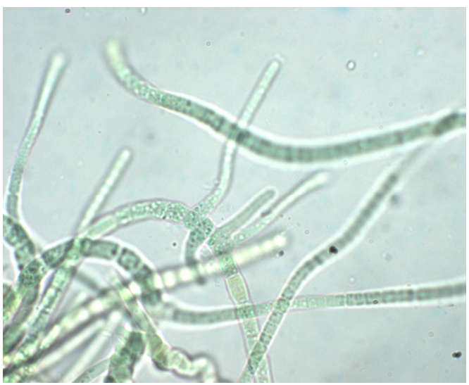
Fig. 3. Branch formation in Hapalosiphon fontinalis.