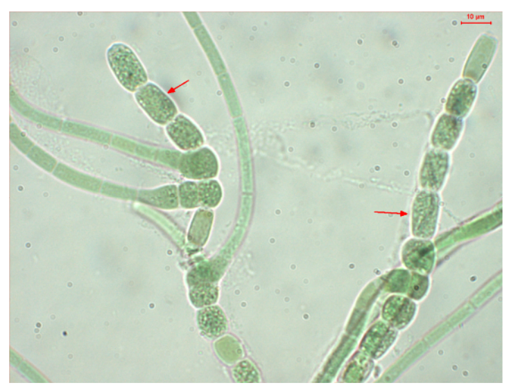
Fig. 4. Sheath of Hapalosiphon fontinalis (Fluerosence microscopy).

investigated, therefore the high variability of morphotypes found in nature is not represented in culture (Shokravi et al. 2002). Only some genera of stigonematalean and nostocalean cyanophyta have been characterized from axenic culture strains yet, including some strains of Fischerella and Nostoc (Soltani et al. 2006, 2007; Ramzannejad-Ghadi 2008; Zarei-darki 2009; Siahbalaei et al. 2010; Shokravi 2003; Sepehri & Nejad- Satari 2003). Results could show a primitive picture of the morphological and taxonomical situation of stigonematalean cyanophyta in paddy-fields of North Iran. These organisms showed relatively variable characters in morphological point of view. It seems pH, irradiances and carbon dioxide fluctuations caused noticeable changes in the morphology of the organism.