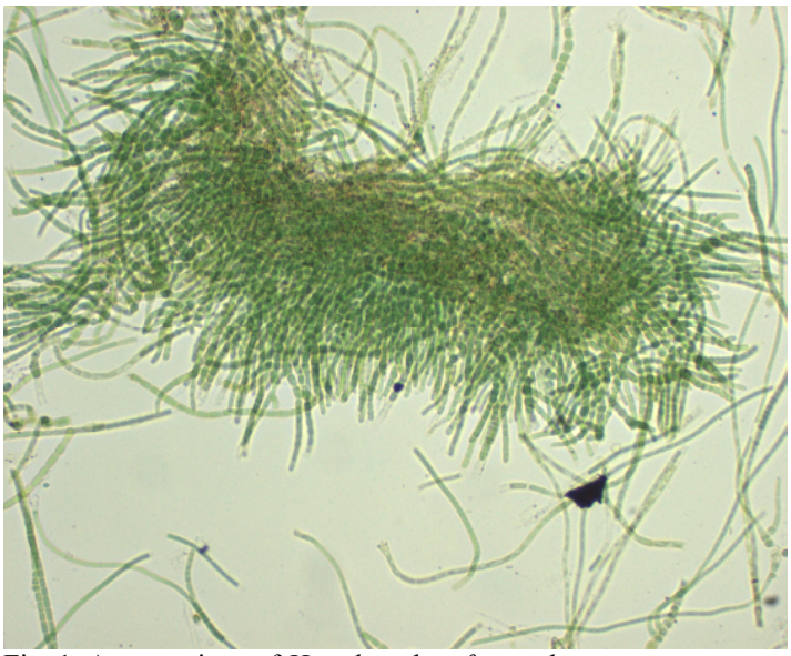
Fig. 1. Aggregations of Hapalosiphon fontinalis.