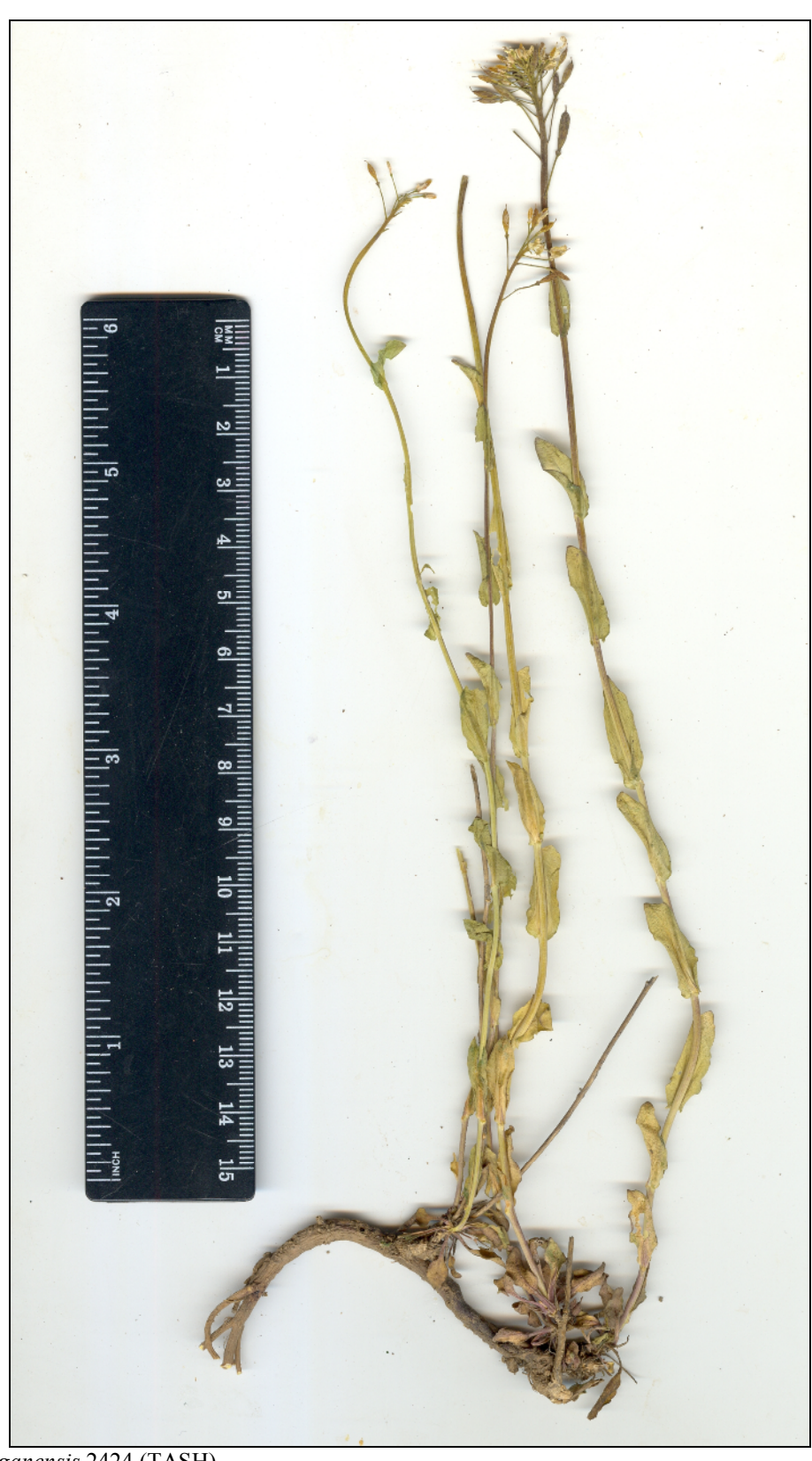
Fig. 2. Noccaea ferganensis 2424 (TASH).