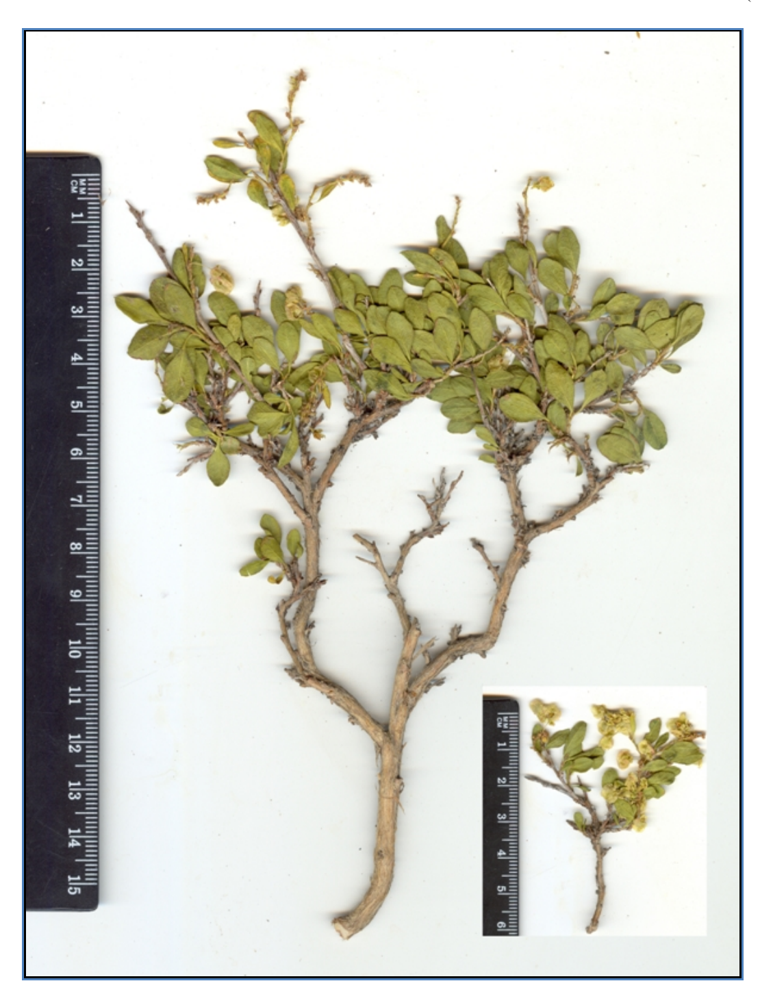
Fig. 1. Atraphaxis laetevirens 1514 (TASH).